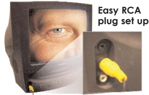
Easy RCA plug set up

Spy Eye, SVAT and "now you can see" are trademarks of SVAT Electronics. ©2004 SVAT Electronics. All Rights Reserved