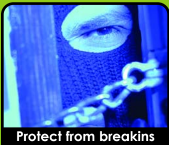
Protect from breakins