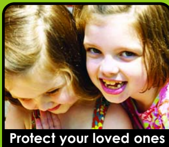
Protect your loved ones