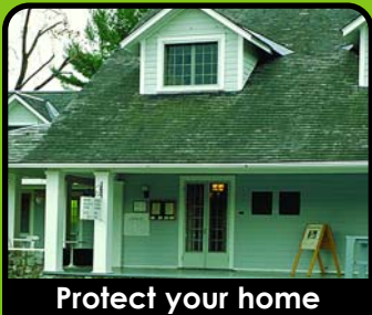
Protect your home