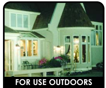
FOR USE OUTDOORS

WRC100: Indoor Model WRC101: Outdoor Model WRC103: Indoor and Outdoor Model Three Separately Sold Models