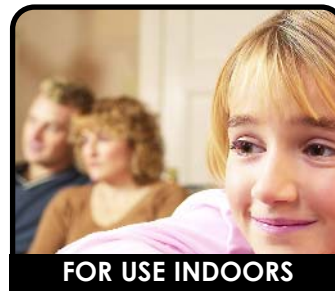
FOR USE INDOORS

The possibilities for the wireless power switch are endless. Use it to power on kitchen appliances. Start your morning coffee brewing before you even head downstairs and have it waiting for you as soon as you reach the breakfast table. It's ideal for those hard-to-reach plug-ins like holiday lights and computer outlets. The kids left the television on and you don't feel like getting out of a comfortable chair to turn it off? Just one handy button and you're in charge.